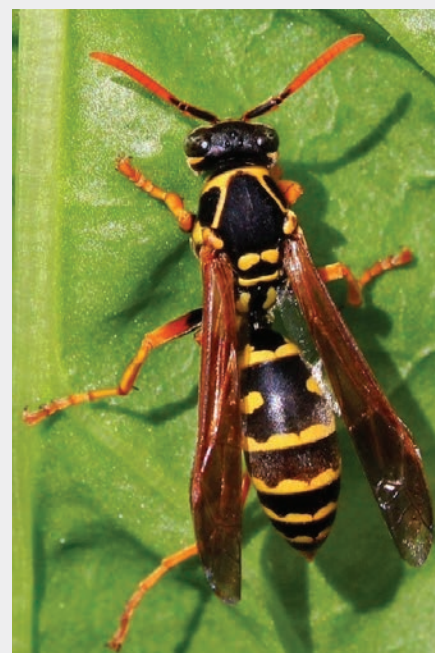
Asian Paper Wasp.