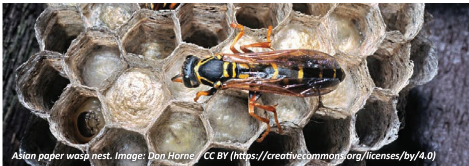
Asian paper wasp nest.

Spray the nest with household fly spray in the evening, when all the wasps are likely to be in the nest. The nest can then be removed by placing a bag under the nest, pulling it up over the nest and clipping the nest off into the bag. Seal and dispose of it in the rubbish or burn it.